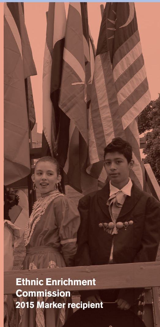
Ethnic Enrichment Commission 2015 Marker recipient

Learn more about The Native Sons and Daughters and the Outstanding Kansas Citian award at NSDKC.org .